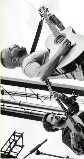
Sounds of Silence An acoustic guitar/vocal duo whose program is a tribute to Simon & Garfunkel and artists of that musical era.