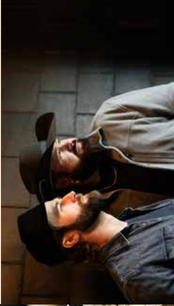
The Swon Brothers "The Swon Brothers know how to win over a crowd..." - Taste of Country