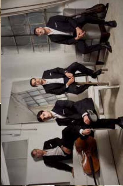
GQ (Gentlemen's Quartet) "...amazing virtuosity, beautiful music and tremendous personality..." - City Stage & Symphony Hall