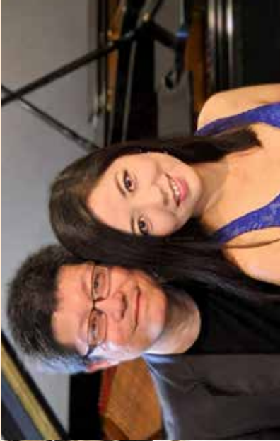
Duo Beaux Arts "...exquisite musicality..." - Fanfare Magazine